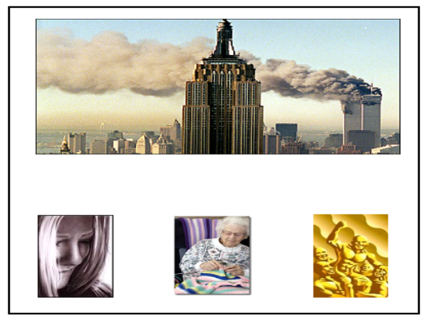
Figure 2: Problem of perceiving September 11

By analyzing tokens of indications it should be possible to perceive how one observes a potentially informative eigenform and assigns meaning to it. In other words, indication forms are the clue to understanding information as constructed by an observer. The following example shows how different observers observe an object differently and thus constructs different information from the same object or no information at all. The author calls it the problem of perceiving September 11.