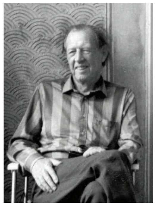
By GwydionM [Public domain], via Wikimedia Commons