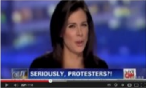
Figure 23. CNN, ibid .