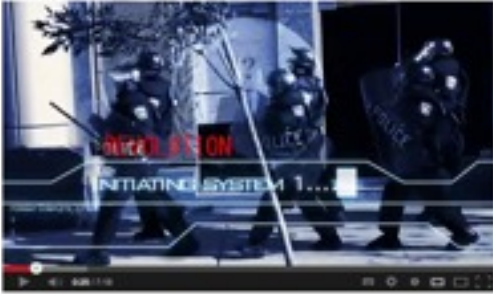
Figure 19. Frame from the YouTube video 'Anonymous – Message to Occupy the World 11-18-11.' Audio-visual protest aesthetics with a video game intertextuality.