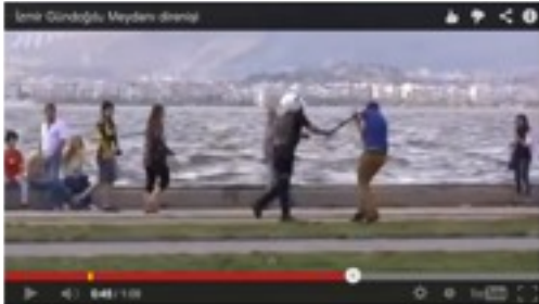
Figure 10. The Turkey riots (2013). Visual evidence of police brutality, distributed by Anonymous and other social movement groups via Twitter and YouTube, etc.