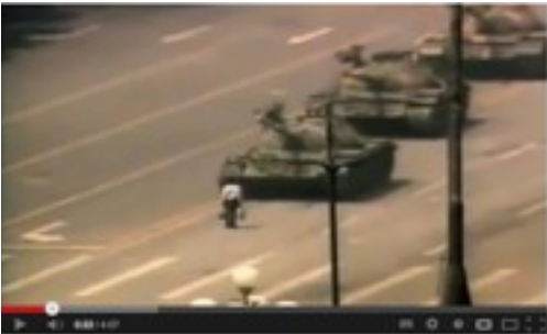
Figure 7. Anonymous reframe of the iconic 'tank man' video, originally from the Tiananmen Square protests in China (1989). 'Operation Tunisia – a press release' (2011).