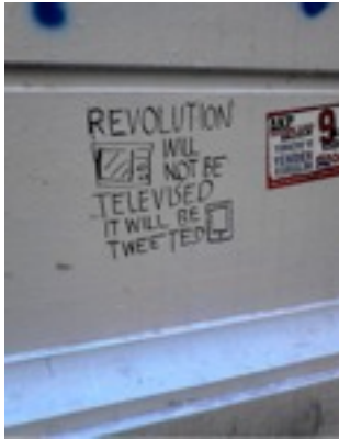
Figure 11. The Turkey riots (2013). 'Revolution will not be televised, it will be tweeted,' i.e. communicated beyond the domestic media frame (shared by Anons via Twitter).