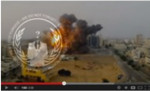
Figure 29. (Re)frame taken from the Anonymous YouTube video 'Op Israel #2.0.'