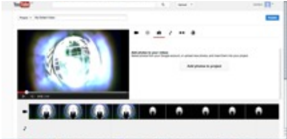
Figure 25. Screenshot from the YouTube editor via the remix option provided by Anonymous.