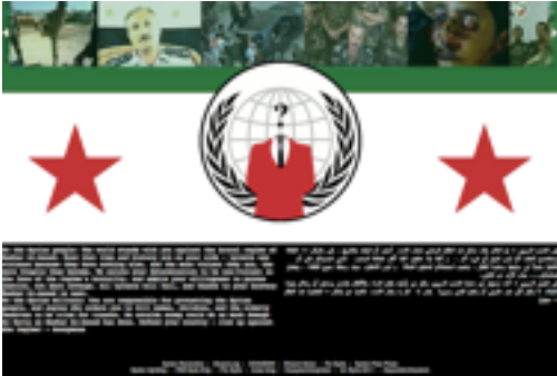
Figure 6. Anonymous hacking the Syrian Ministry of Defence website (2011). A stream of Youtube links and videos showing injured civilians/children can be seen above, together with images of Syrian soldiers defecting.