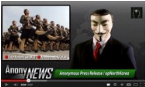
Figure 32. Frame from the Anon YouTube video ‘Anonymous vs NorthKorea.’