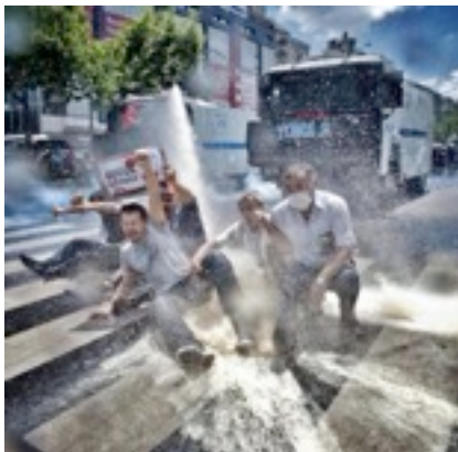
Figure 12. 'Power to the people' (2013), distributed by Anonymous, et al. via Twitter (@an0nyc).