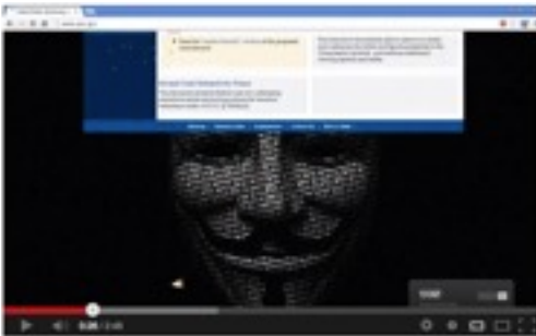
Figure 16. Screenshot of the website, after the Anonymous re-hack, transformed into the video game Asteroids (here via YouTube).