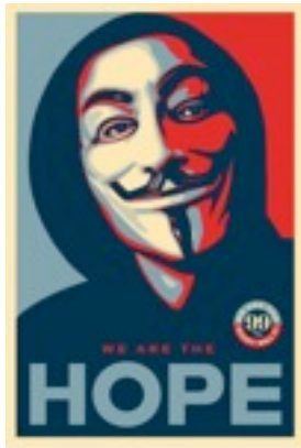
Figure 27. 'Occupy Hope', designed by the artist Shepard Fairey.