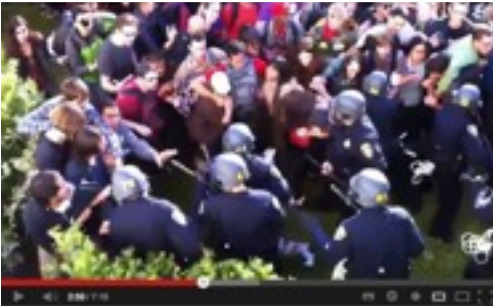
Figure 20. Institutional violence at Occupy Cal (Berkeley, 2011), police attacking students. Frame from the YouTube video 'Anonymous – Message to Occupy the World 11-18-11.'