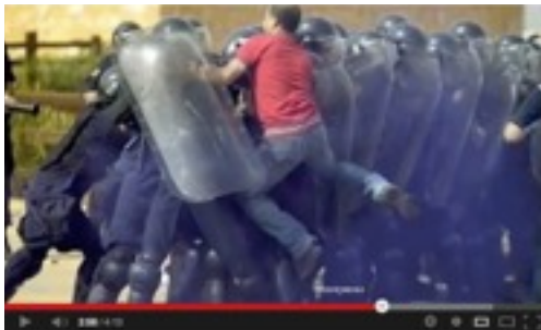
Figure 33. Frame from the Anon YouTube video 'Anonymous: A Message to Humanity.' (Background speech by Chaplin from The Great Dictator , 1940.)