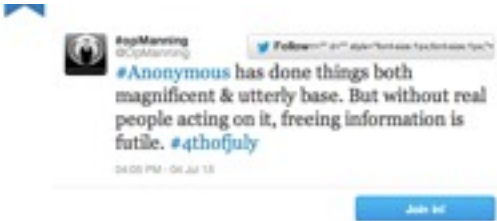
Figure 18. Screenshot of a tweet written by Anon associate @OpManning, referring to the importance of 'offline tactics.'