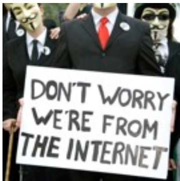
Figure 3. Anonymous protesting with the black suits and the Guy Fawkes masks.