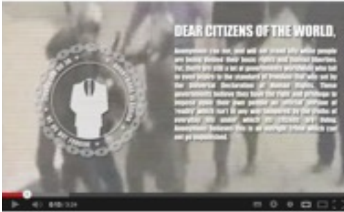
Figure 13. Police brutality shown in the 'OpEgypt' audio-visual press release.