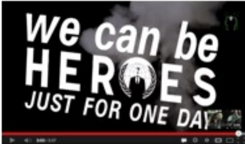
Figure 31. Frame from the Anon YouTube video ‘Anonymous vs NorthKorea.’