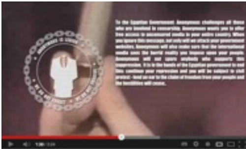
Figure 14. Civilian holding up a gun shell fired from Egyptian police; 'OpEgypt' audio-visual press release.