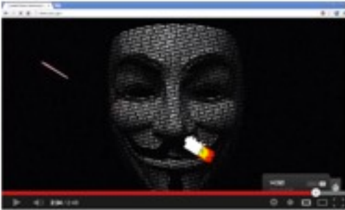
Figure 17. Final sequence of the Asteroids game.