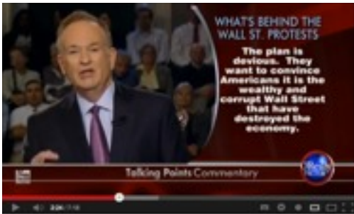
Figure 22. Fox News pointed out as 'puppet media.' Frame from the YouTube video 'Anonymous - Message to Occupy the World 11-18-11.'