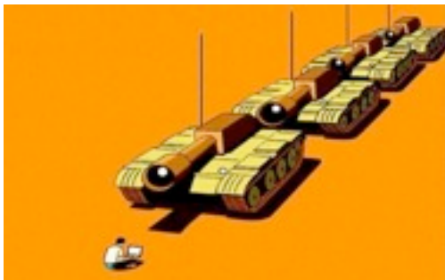
Figure 8. Anonymous reframe of the reframe, here with a new title: 'One has the moral responsibility to disobey unjust laws,' distributed by Twitter via Anonymous Sweden (@AnonNewsSwe, 2013).