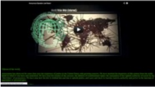
Figure 15. Screenshot of the hacked website of the United States Sentencing Commission, including the Anonymous YouTube video 'Operation Last Resort' (first hack).