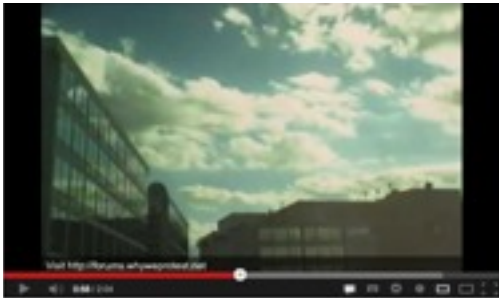
Figure 1. 'Message to Scientology' (2008).