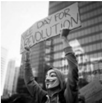
Figure 2. Street protests, Anons wearing the Guy Fawkes mask.