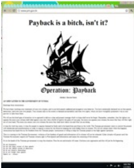
Figure 5. 'Payback is a bitch, isn't it?' Tunisian government web hacked by Anonymous.