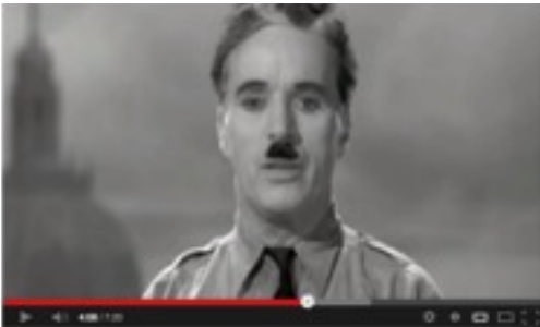
Figure 26. Anonymous YouTube video 'Anonymous, LulzXmas' also posted on the hacked Stratfor web site (2011). The video is compilation of actions made by Anons during 2011, ending with Chaplin's emotive discourse on freedom from The Great Dictator (Chaplin, 1940).