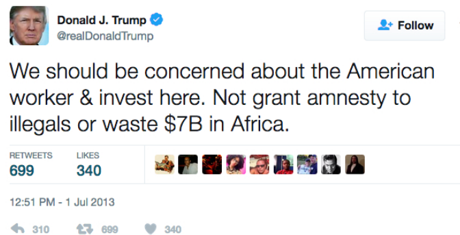
Figure 2: Tweet by Donald Trump (Example 2)

How can Anxiety and Politics help us to understand the political-economic, ideological and psychological dimensions of such social media postings? Trump appeals in his political communication to those, who feel or fear the negative impacts of capitalism, neoliberalism, inequalities, unemployment, social decline, or de-industrialisation. He speaks to those who feel or have the fear that their labour is or could become highly alienated (a) and that capitalism's new-imperialist globalisation has resulted in destructive competition that brings about precarity and unemployment (b), to those who feel or fear that their social status declines (c), and to those who are fed up with the existing political parties, politicians, and politicians whom they see as corrupt elites (d). Trump himself is as a political Leader an institutionalisation of such anxieties (e). He communicates simple nationalist solutions to complex problems by using right-wing ideology as destructive political response to anxiety (f).